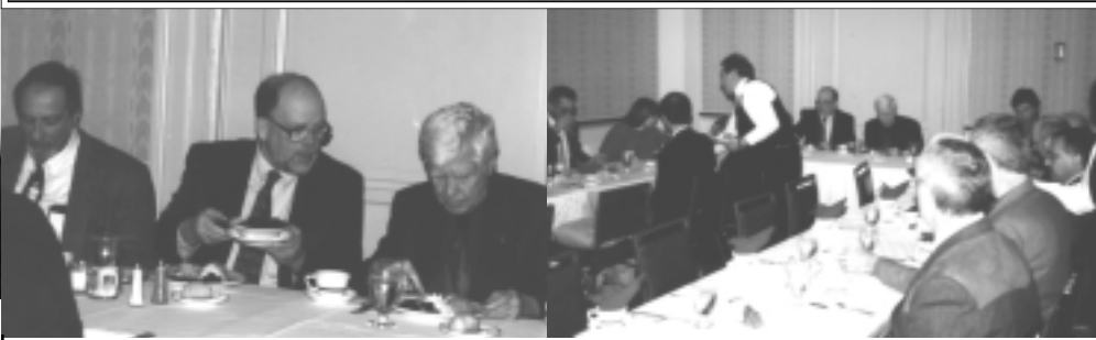
Former U. S. Senator John Melcher hosts Committee members to lunch in Senate wing of Capitol