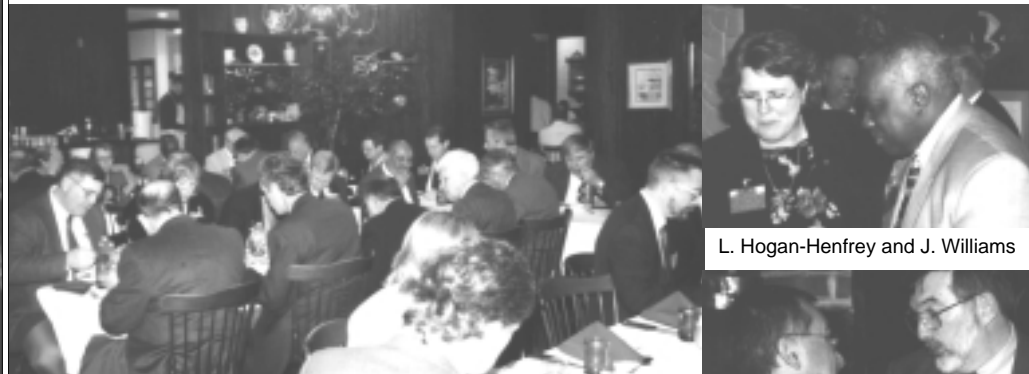
Evening banquet for Committee arranged by APHIS, VS